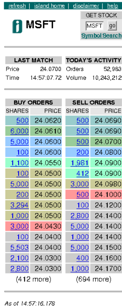
Figure 2: Sample Island order books for MSFT.

In many online problems, there is a clear distinction between “benefit” problems and “cost” problems [2]. In the VWAP setting, selling shares is a benefit problem, and buying shares is a cost problem. The definitions of the competitive ratios, R_{\text{VWAP}}^{\text{buy}}(A) and R_{\text{OWT}}^{\text{buy}}(A) , for algorithms which